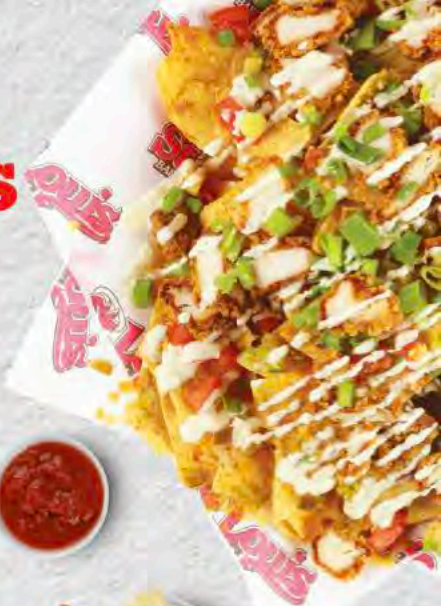
Signature Wings Nachos