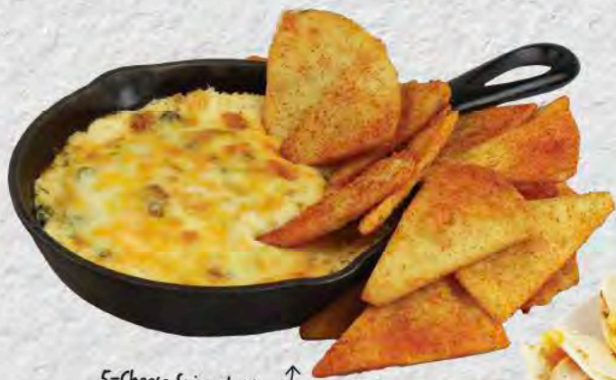
5-Cheese Spinach Dip