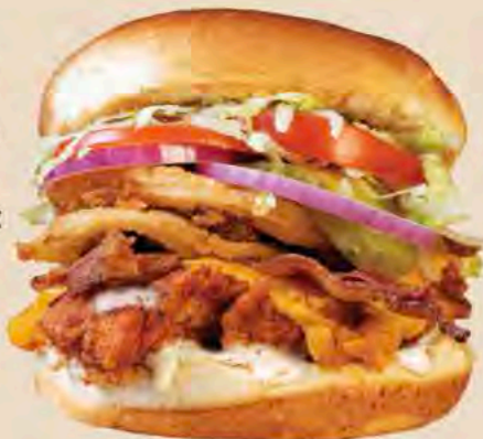
Garlic Dill Chicken Sandwich