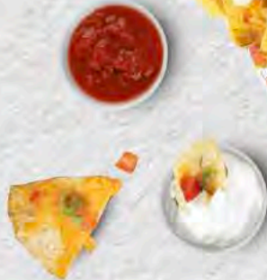
Signature Wings Nachos