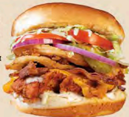
Garlic Dill Chicken Sandwich