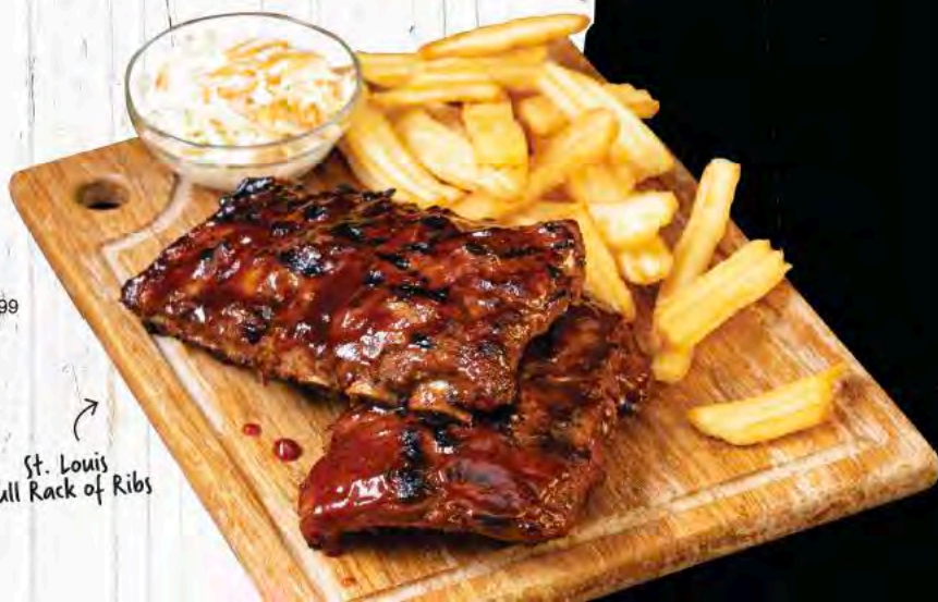
St. Louis Full Rack of Ribs