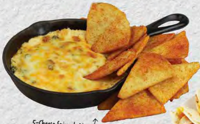
5-Cheese Spinach Dip