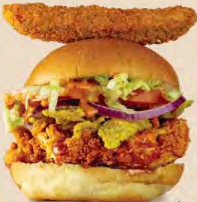
Honey Cajun Chicken Sandwich

Hand-breaded and fried chicken tenders tossed in Buffalo sauce, topped with romaine lettuce, creamy garlic Caesar dressing, smoked bacon and Parmesan cheese, all wrapped up in a freshly grilled flour tortilla. $17.99