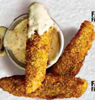
Deep Fried Pickles

Our signature golden fries topped with cheese curds and gravy. $13.99